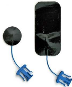
Figure 3: E-Set Electrodes