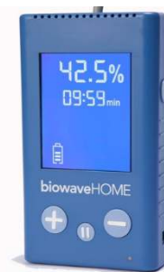
Figure 1: BiowaveHOME Neurostimulator

The BiowavePRO and BiowaveHOME neurostimulators are non-pharmacologic, non-narcotic, non-addictive, non-invasive adjunct of pain (Figure 1). The two devices work in an identical manner by delivery back and forth of a summation of two high frequency sinusoidal alternating current signals at 3,858 hz and 3,980 hz to a first electrode and then to a second electrode. The electrodes are placed directly over one or two locations of pain.